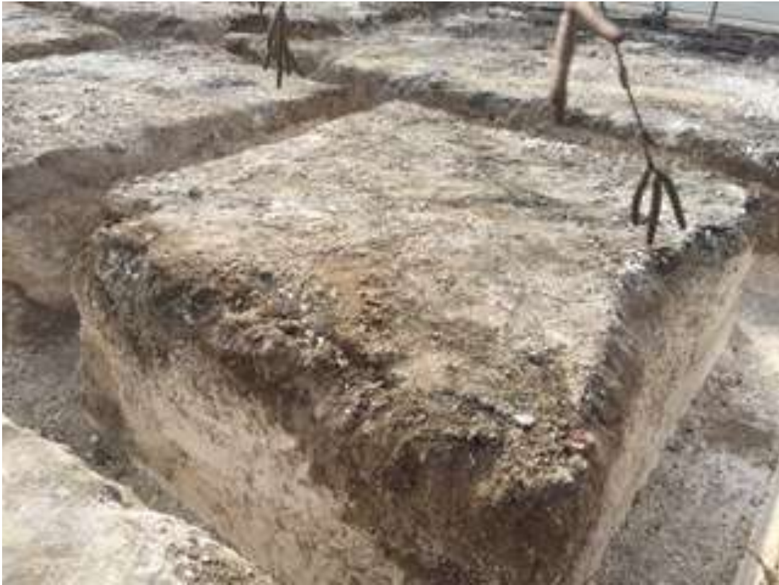
Plates 3 & 4 View of foundations and (below drainage)