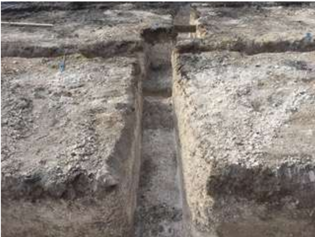
Plate 2. View of foundations