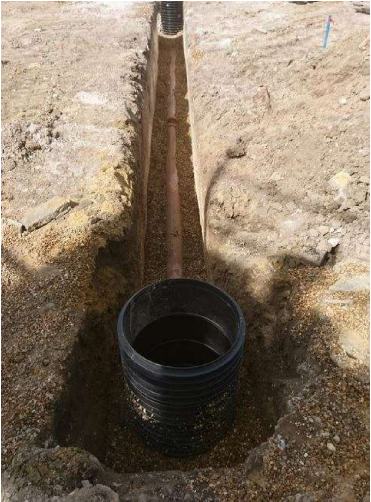
Plate 5. View of drainage