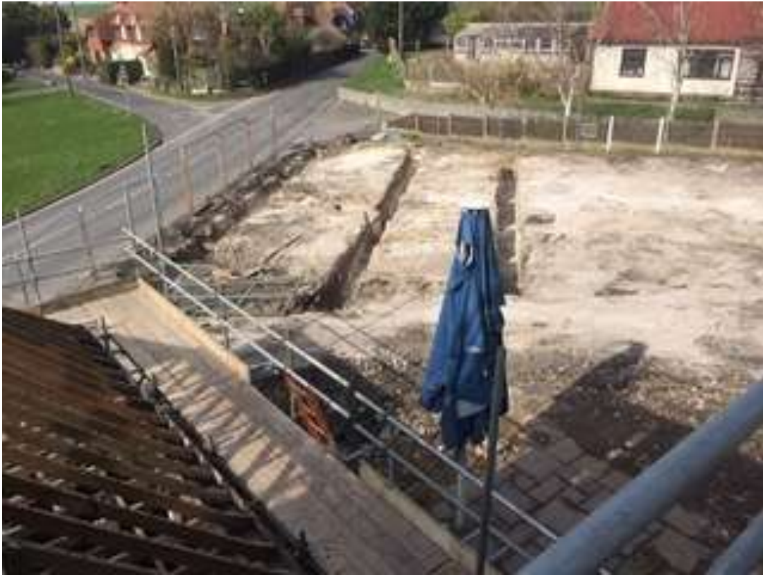
Plate 1. View of Site