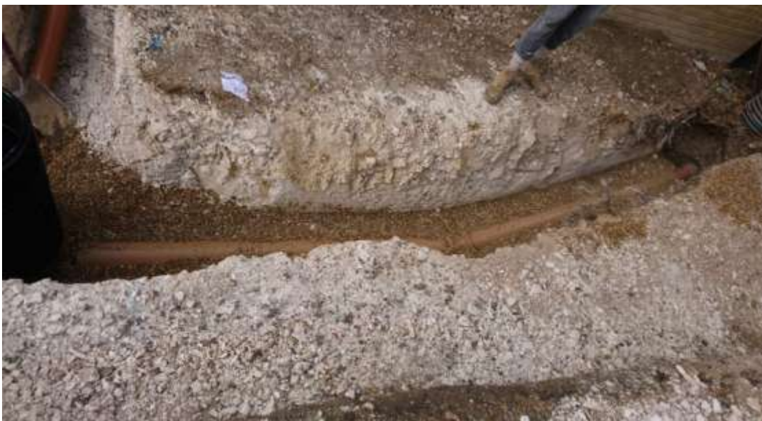
Plate 7. View of drainage