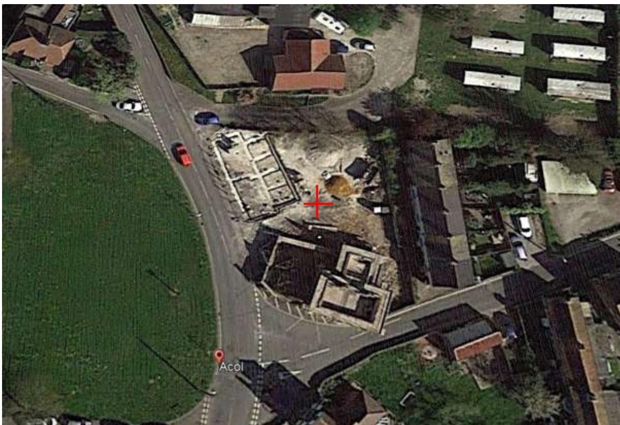
Plate 1. Aerial view of site (red target) showing the site during development.