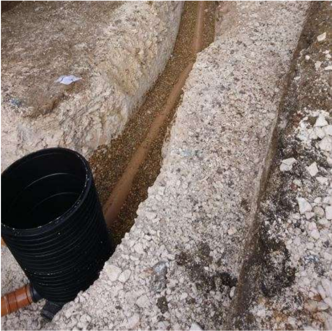
Plate 6. View of drainage